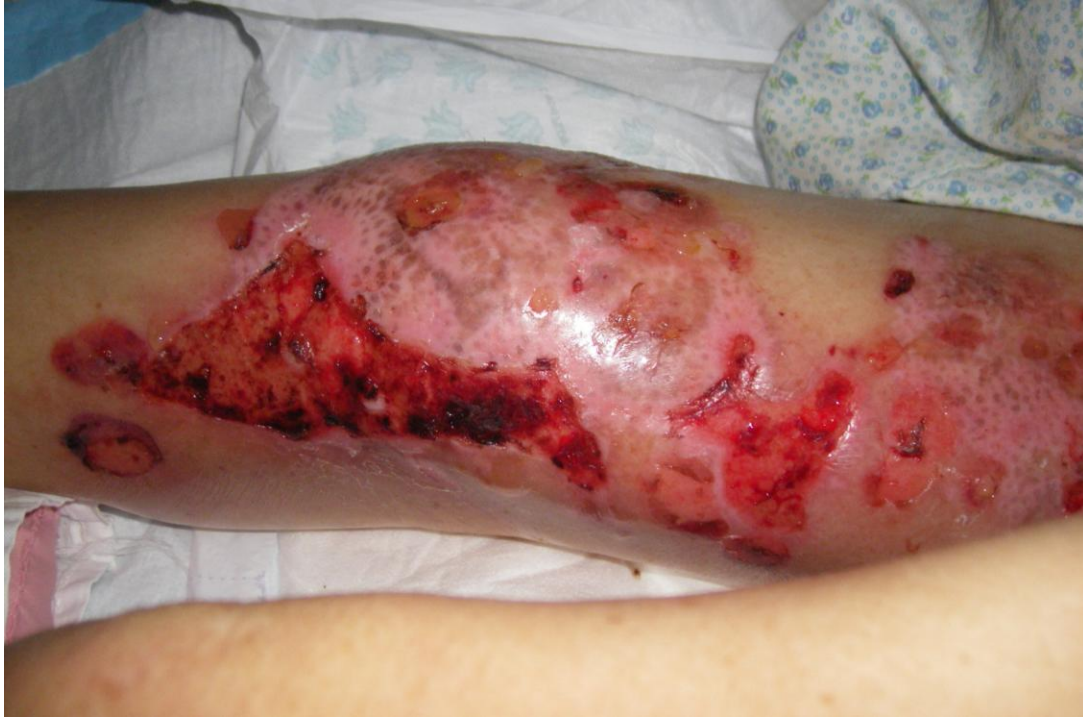
Ten Days After Silver Sol Treatment. Note islands of epithelialization (indicating stem cell activity).